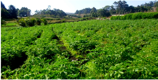
Figure 2. Potato Seed Multiplication Farm in Simonkoh Oku

To obtain information on how to use these seeds the farmers attend seminars organized by ZEW and HEIFER project. Types of potatoes produce include Cipira , Spunter , Manon and Tupira . The produce gotten from these seeds contributes greatly in potatoes yields. To boost production, farmers prefer high yielding seeds to plant in their farms through single cropping farming system. Findings shows that about 95% of farmers prefer to grow Cipira , Tupira , and Manon potato specie. The adoption of this approach is due to the fact that, they produce high yields and is also good for consumption. The species are highly consumed by the Oku population than the Spunter specie [5].